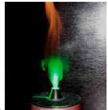
Aluminum Oxide particles give flame a green appearance where the laser beam passes through flame.