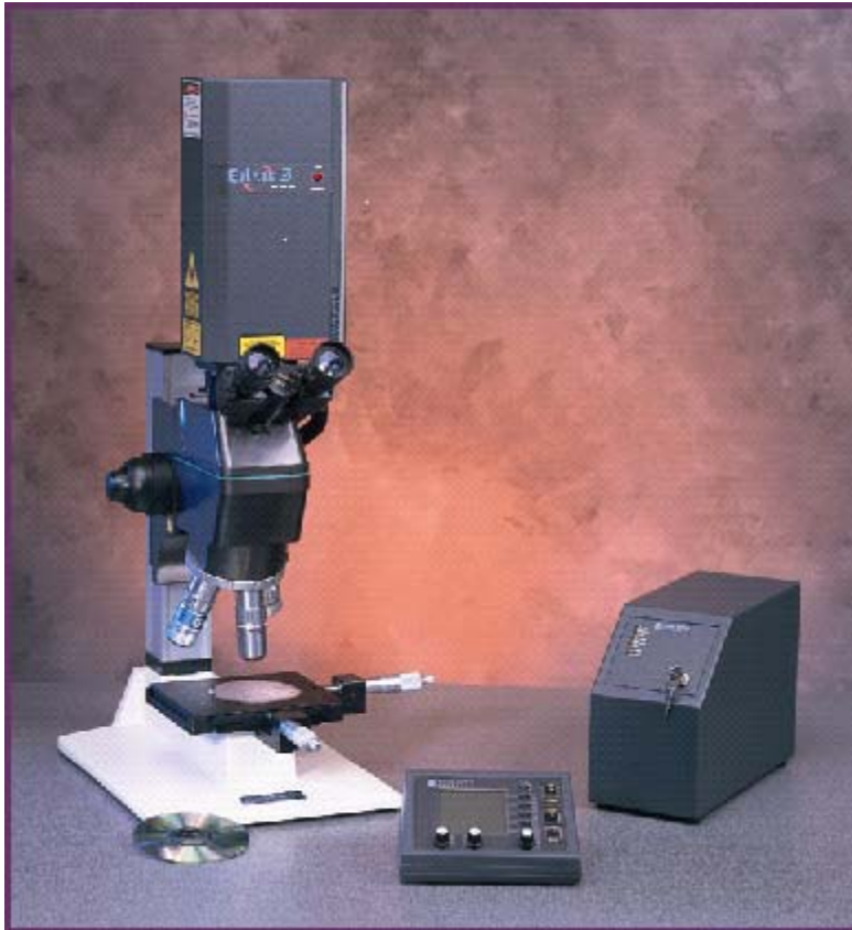
EzLaze 3 shown with power supply and remote control. Microscope, stage and stand are options.

for Semiconductor Failure Analysis and LCD Repair