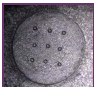
750 µm spot with 30 µm spot raster, in NIST 610 glass