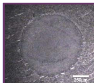
At left is a 1 mm crater in NIST 610 glass. With the UP266MACRO, 266nm, short UV ablation has broken the 1000 µm barrier.