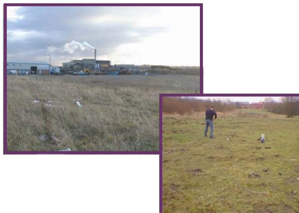
Figure 1: A brown-field site in Nottingham and a landscaped landfill in Wolverhampton

The aim of this study was to identify the composition and bioavailability of different lead sources and compare them to the natural background signature. The soil samples were leached, using