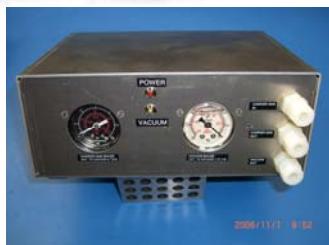
Vacuum/Gas control box

New Wave™ Research introduces the new Large Format Cell (LFC™) accessory for UP213 series.