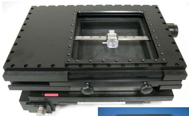
Large Format Cell